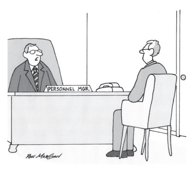
"I'm not easily impressed by hyphenated names, Mr. Sm-ith."